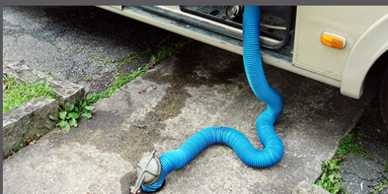
NATURALLY SUPPRESSES ODOURS